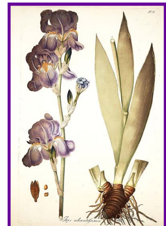
Iris odoratissima jacquin, found on Pinterest