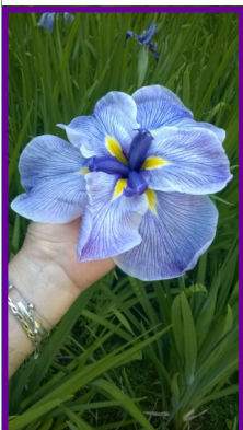
Left, right: Japanese irises in the Portland Japanese Garden.