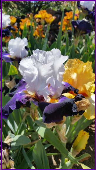
Grace Upon Grace Hummingbird iris Garden, Prescott

An Affiliate of the American Iris Society