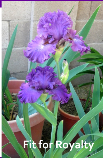
Fit for Royalty