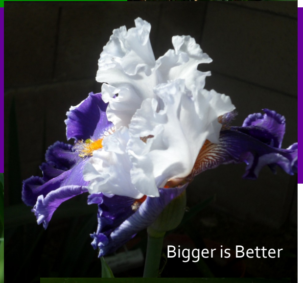
Bigger is Better