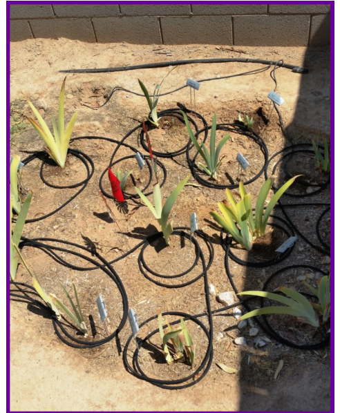
Photo 3: Irises showing typical summer stress with browning on the tips of the leaves, which occasionally brown all the way down. Their heat stress is exacerbated by proximity to the block wall, which likely causes the yellowing. Thanks to Madeleine for suggesting the dripline soaker hoses!